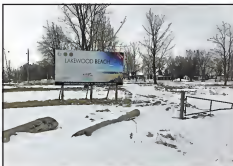
The Niagara Peninsula Conservation Authority purchased 15 acres of this 54-acre parcel of land in Wainfleet from a developer who plans on building condominiums on his remaining land.

May we take the opportunity to do some kind of interpretation for people to see, to understand (the toad). Access to the water is another issue that will prob-